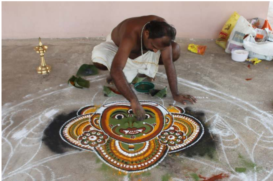
The ancient ritual of Kalamvarichipat of Nilambur. Oracles draw the mural of the deity with their bare hands which they later invite to possess their body.