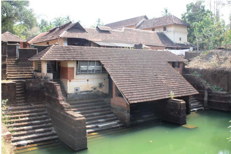
The family pond of Maranat Mana. It's here the secrets of some of the oldest rituals known to mankind are passed on from father to son.